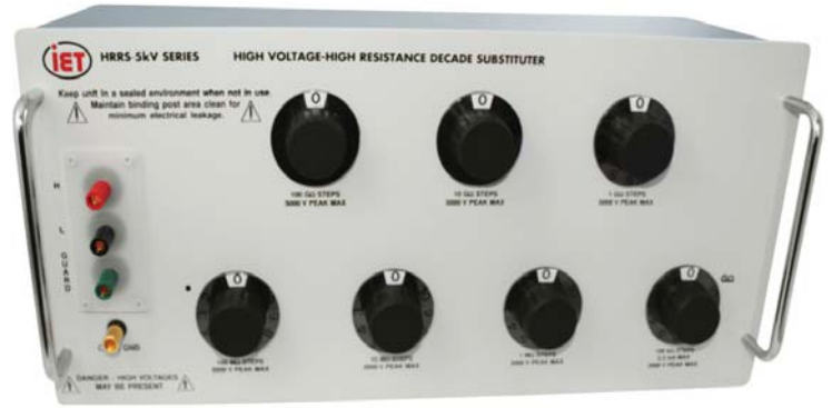
HRRS 7-Decade High-Voltage Substituter